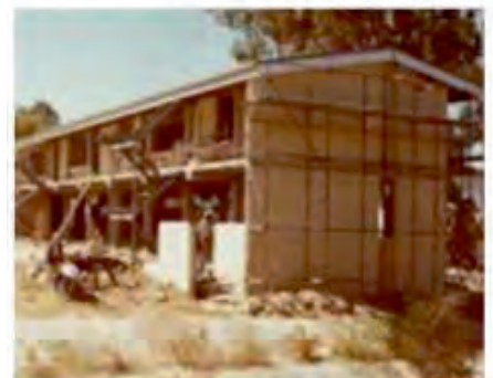
J Block 1979 (Current Nagle Building)