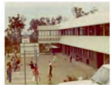
Basketball Courts 1975 (Current Servant Court)