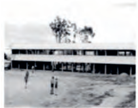
A Block 1974 (Current Turton Building)