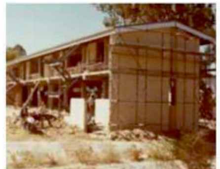
J Block 1979 (Current Nagle Building)