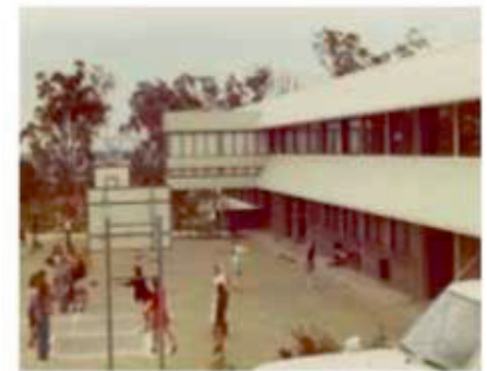
Basketball Courts 1975 (Current Servant Court)