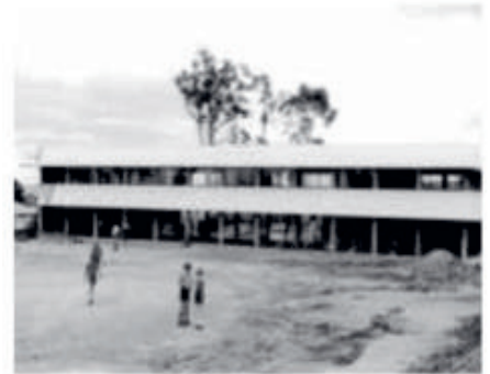
A Block 1974 (Current Turton Building)